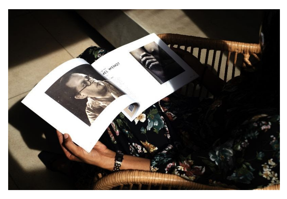
Sourcing Art Related Literature

ARTRA help client/s source information and literature on related content on Sri Lankan Art, Culture & Heritage. Through a series of interviews, conversations with artists, academics, archaeologists, historians, collectors, curators etc. This service will help client/s understand the scope of artistic expression to the degree they require. ARTRA provides knowledge on, and accessibility to authenticated information on Modern and Contemporary Art and artists, as well as resources from ARTRA's website archives, collection of magazines, books specialized in relevant content. ARTRA's service provides client/s access to sourcing art literature on a vast field of subjects for a deeper understanding of the visual, performance, written, applied and the culinary arts. Contact us on +9477 570 1891 or email us on artservices@artra.lk