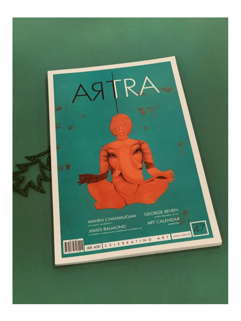
Plan your seasonal gifting earlier this year with us!

We are happy to custom-tailor your art giftings for you from editions of your choice of which you may gift to your family, loved ones and colleagues in a tasteful way.