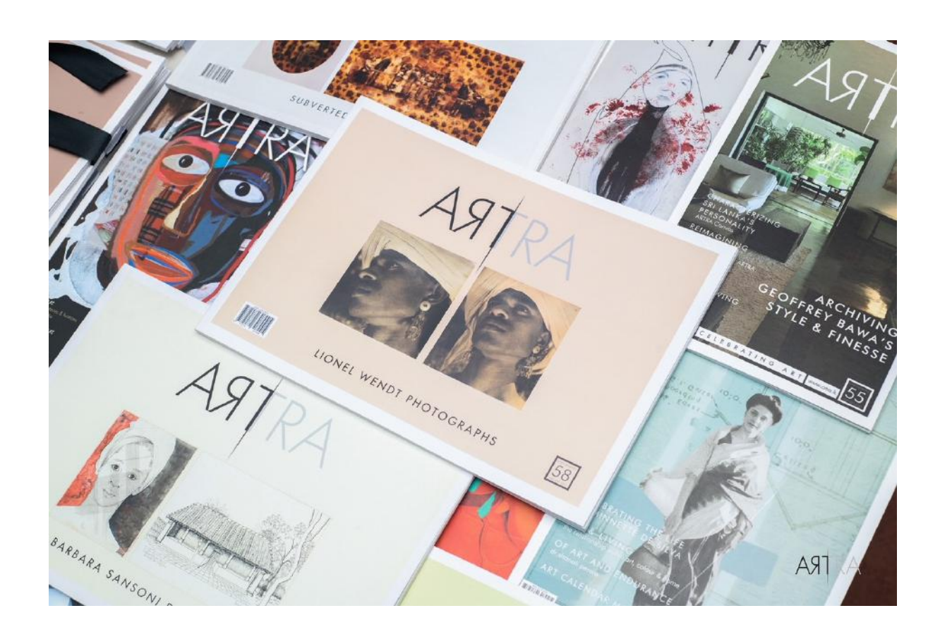
The '43 Group Edition coincides with ARTRA Magazine's Lionel Wendt Edition (2021), as they collectively present a holistic understanding on the emergence of Sri Lanka's Modernism in the early 1920's, its novelty & characteristics.

For your Lionel Wendt edition, and past editions of ARTRA Magazine, call us on +9477 570 1891. For your online copies visit <a href="www.artra.lk/subscribe">www.artra.lk/subscribe</a>. For queries call +9477570 1891 or email artservices@artra.lk