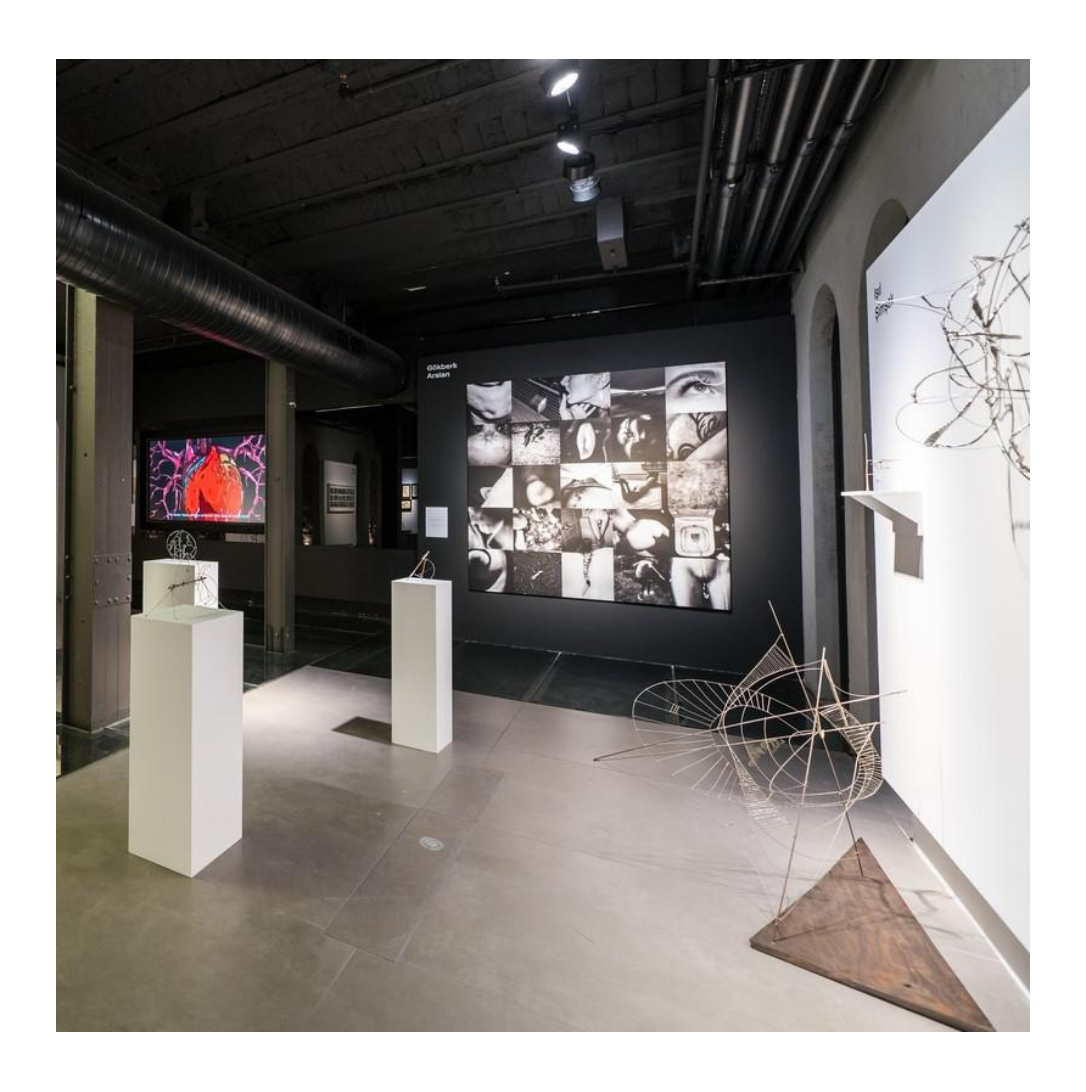
Mamut Art Project I Istanbul's Contemporary Art Exhibition

Mamut Art Project is the biggest art event and first fair dedicated to providing a dynamic platform for independent & emerging artists and to the concept for attainable art since 2013. Turkey's unique art event is dedicated to provide a dynamic platform for undiscovered creative talent and engaging them with new and established collectors, galleries, curators and art lovers. Mamut is a rent free platform, offering undiscovered artists the opportunity to professionally showcase their works in their own personal exhibition space. As well as providing curatorial guidance, PR support and network opportunities during the exhibition, Mamut Art Project is also proud to give professional advice on the careers of each participating artist after the exhibition.