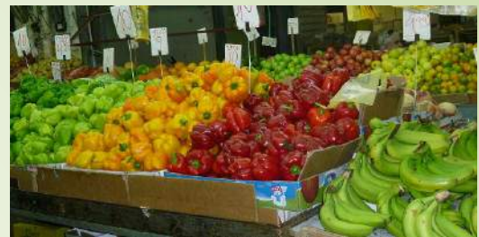
Fresh produce at the market

The learning from the tour will be transferred to the entire field force of HNB and to the farmer community across the branch network.