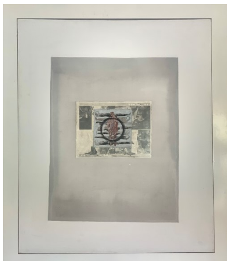
Druvinka Puri | 84 inches by 72 inches | 295 000 LKR |