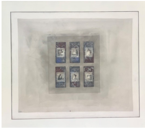
Druvinka Puri | 7 inches by 83 inches | 275 000 LKR |