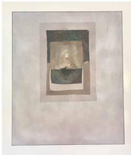
Druvinka Puri | 84 inches by 72 inches | 320 000 LKR |