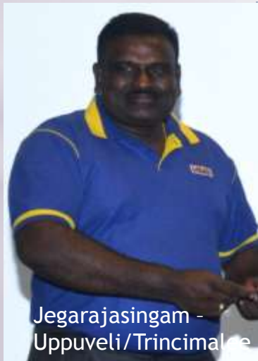
Jegarajasingam - Uppuveli/Trincimalle