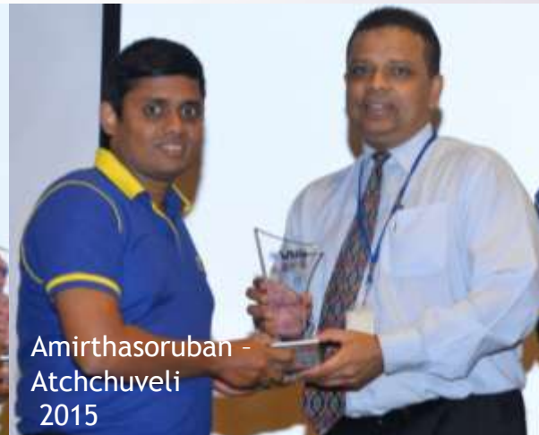
Amirthasoruban - Atchchuveli 2015