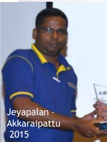
Jeyapalan - Akkaraipattu 2015