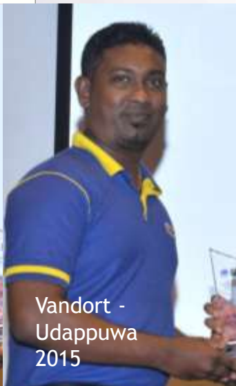
Vandort - Udappuwa 2015