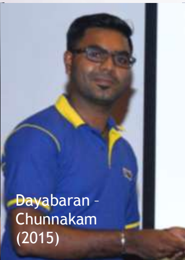
Dayabaran - Chunnakam (2015)