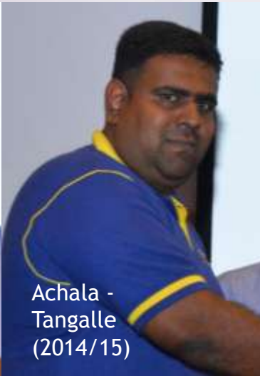
Achala - Tangalle (2014/15)