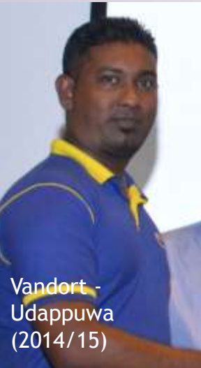
Vandort - Udappuwa (2014/15)