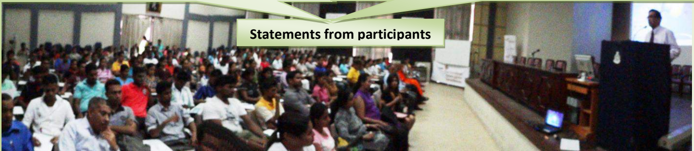
Statements from participants

“මෙම පුහුණු වැඩසටහන අපට ඉතාමත් වටිනා අත්දැකීමක් වූවා. ආරම්භ කිරීමට යන්නාවූ වෘත්තීය ජීවිතය සාර්ථක කරගැනීමට අවශ්‍ය අධිකාරමක් මෙයින් වැටුණි. වෘත්තීය සාර්ථකත්වය කරා ලඟා වූ ඉහල මට්ටම්වල සිටින අයගේ අත්දැකීම් බෙදාගැනීම මෙම වැඩසටහන පිටුවහලක් වූණි. මෙවැනි වැඩසටහන් ඉදිරි වැඩලෝකයට උචිත සාර්ථක සේවාදායකයන් බිහිකිරීමට ඉවහල් වෙයි.”